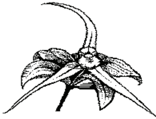
The Greater Whorled Pagonia Official Flower of the