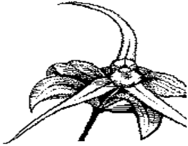
The Greater Whorled Pogonia