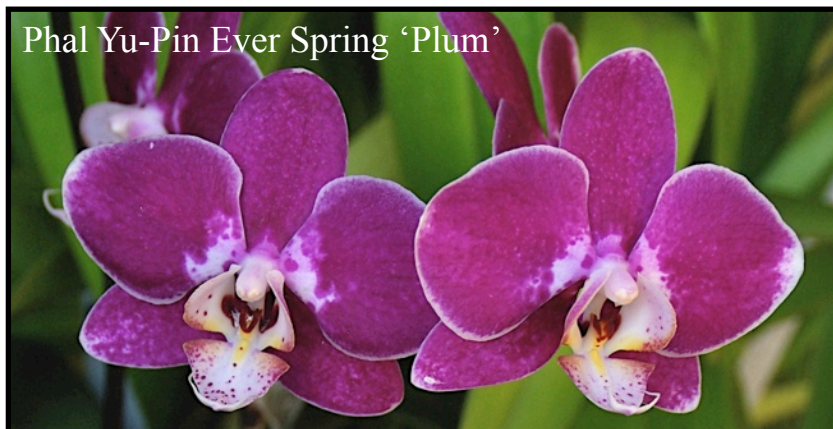
Phal Yu-Pin Ever Spring 'Plum'