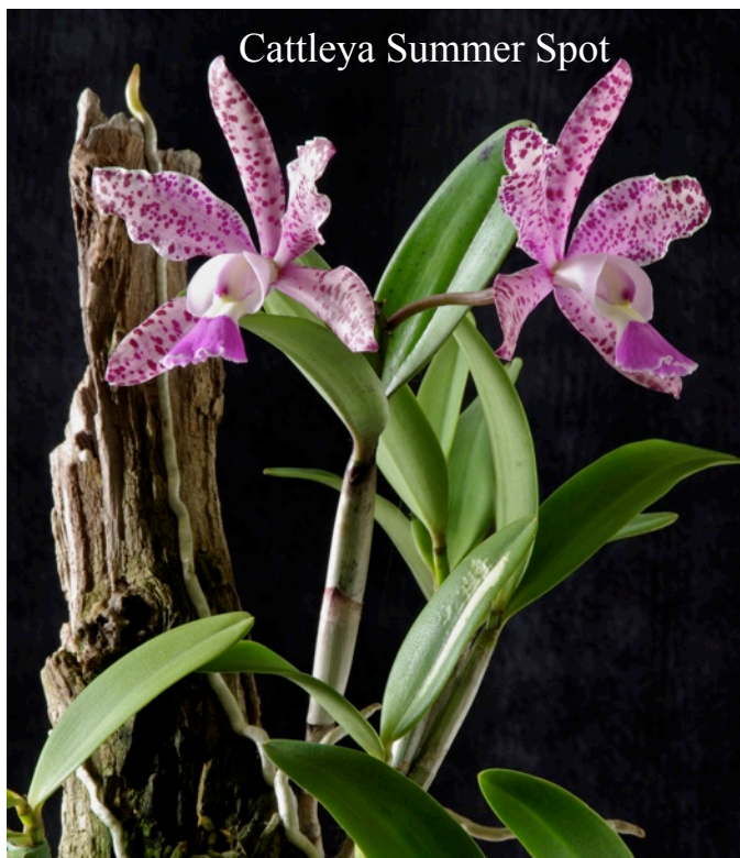
Cattleya Summer Spot