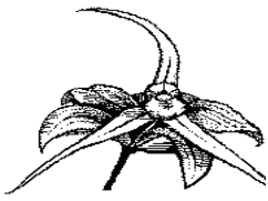
The Greater Whorled Pogonia Official Flower of the Club